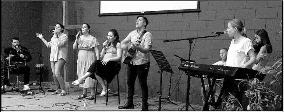
CrossRoads Worship Team leading Praise at this year's BUNT Assembly