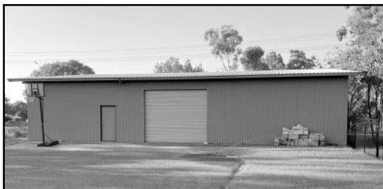
Could this be the next NT Men's Shed ?

Recently a meeting was held for those interested in starting up a Men's Shed. Watch this space!