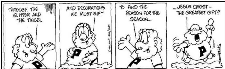
Used with Permission