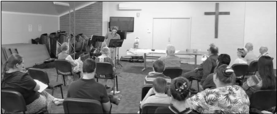
Sharing the Gospel at Mataranka

Monthly, separate Ladies and Men's Breakfasts continue to be held at McLagan's Farm with a guest speaker as well as a bountiful breakfast. A regular favourite on the Church calendar, these informal breakfasts present an opportunity to invite friends from outside the church and also to fellowship with people from different denominations