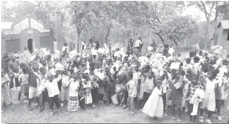
Malawi kids show the gifts sent by Cornerstone kids