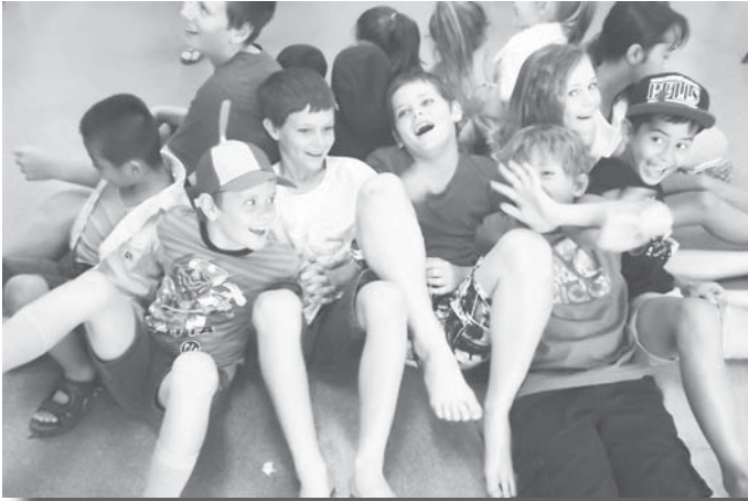
Cornerstone kids have fun