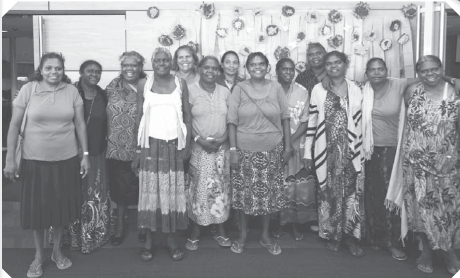
Women came from around the Territory to attend the Baptist Women's Together Conference in Darwin