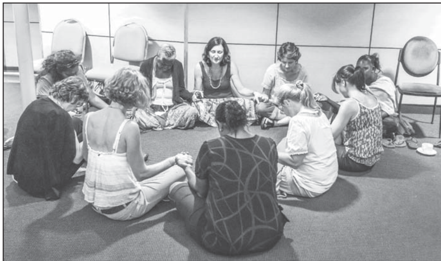
Women from around the Territory pray for each other at the recent 'Together' Conference.

Get your copy from Baptist World Aid Freecall 1300789991 or email hello@baptistworldaid.org.au Cost: $11.95