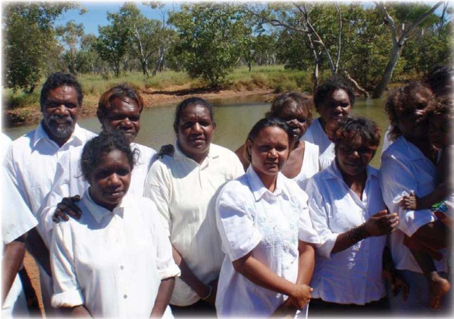
Easter Baptisms at Lajamanu