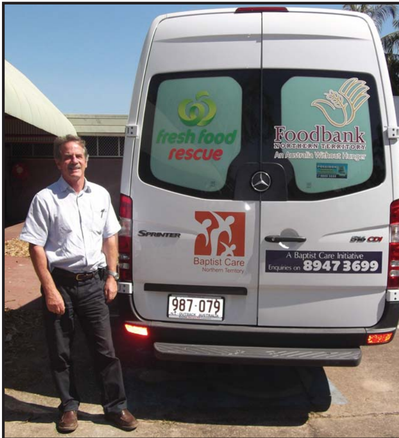
Refrigerated Van donated by Woolworths