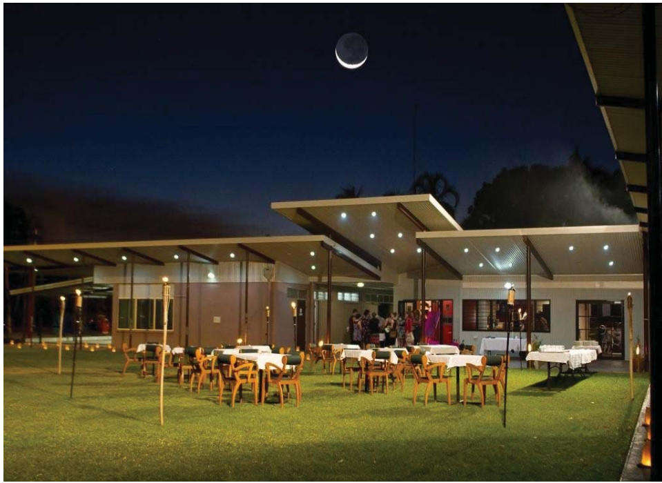
The lawns of Darwin Baptist Church, under a new moon, provided an ideal setting for the Women's Coffee and Dessert Evening