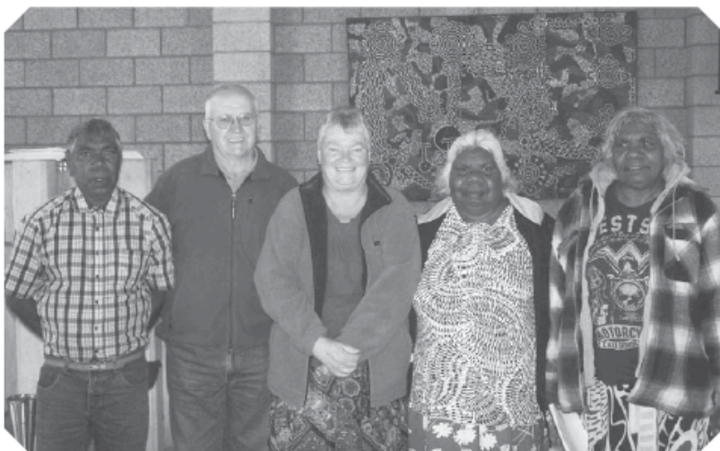
The Yuendumu Team

Newsletter of the Baptist Family of Churches in the Northern Territory