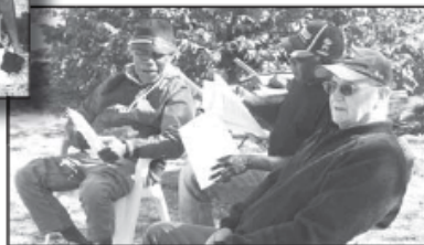
Yuendumu ladies share at Prayer Training Weekend