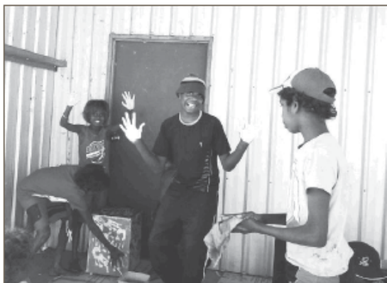
Lajamanu kids having fun painting drums

T he Sunday School has a monthly roster of helpers who teach and help the young kids on a Sunday. They work at preparing and planning for consistent teaching of Bible Stories. Over the past two months they have been looking at Moses. Singing action songs, hearing stories on the life of Moses and doing activities all help the kids to remember the main points of what they are learning. The children contribute with much noise, mess and enthusiasm, participating in colouring, cutting out, painting and, singing.