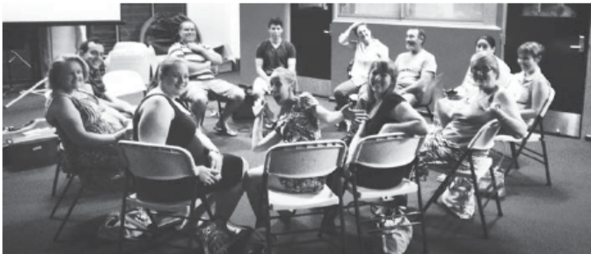
The Worship Team at practice